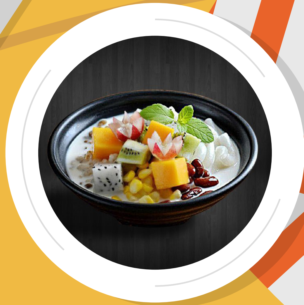
Qing Bu Liang

Indulge in must-try Chinese street food like: