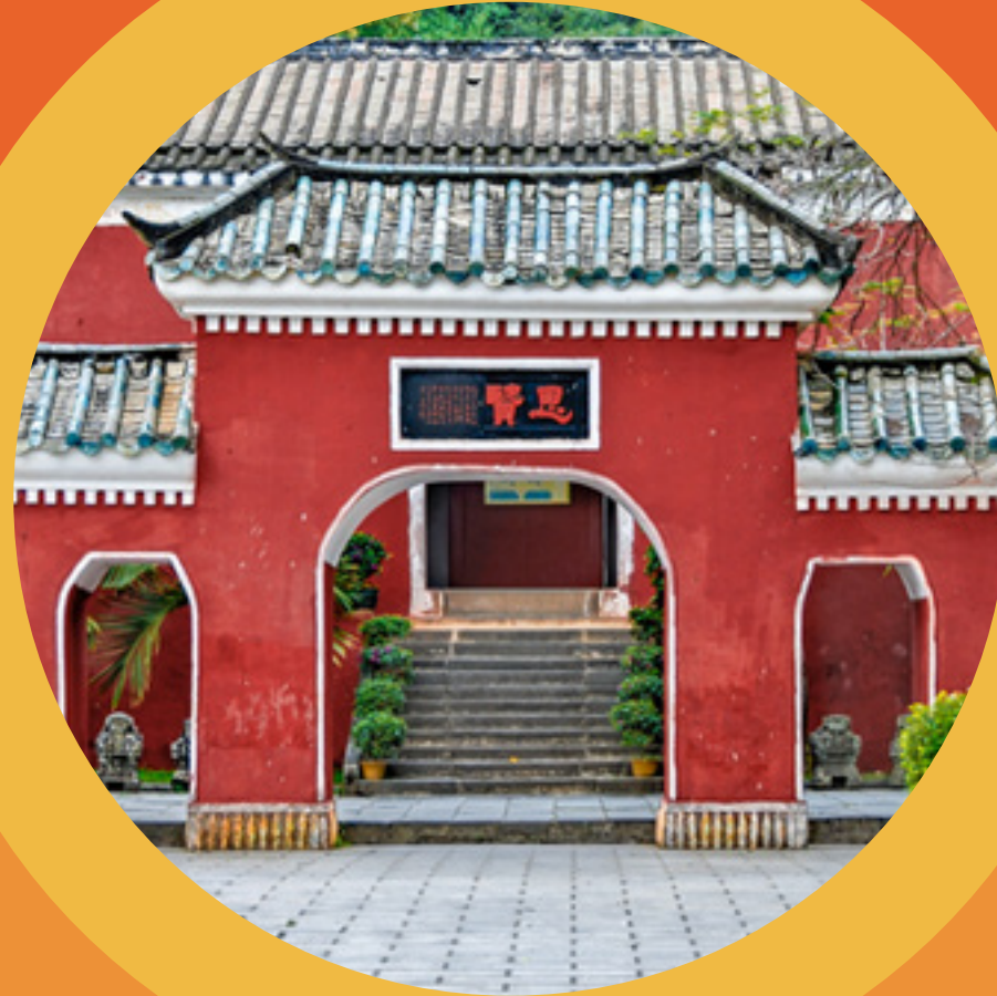
Visit the Temple of the Five Lords