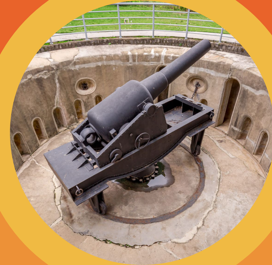
Explore Xiuying Fort