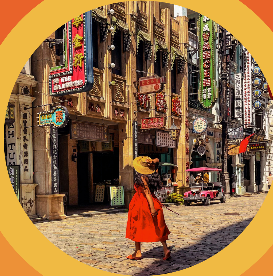
Take a stroll down Movie Town