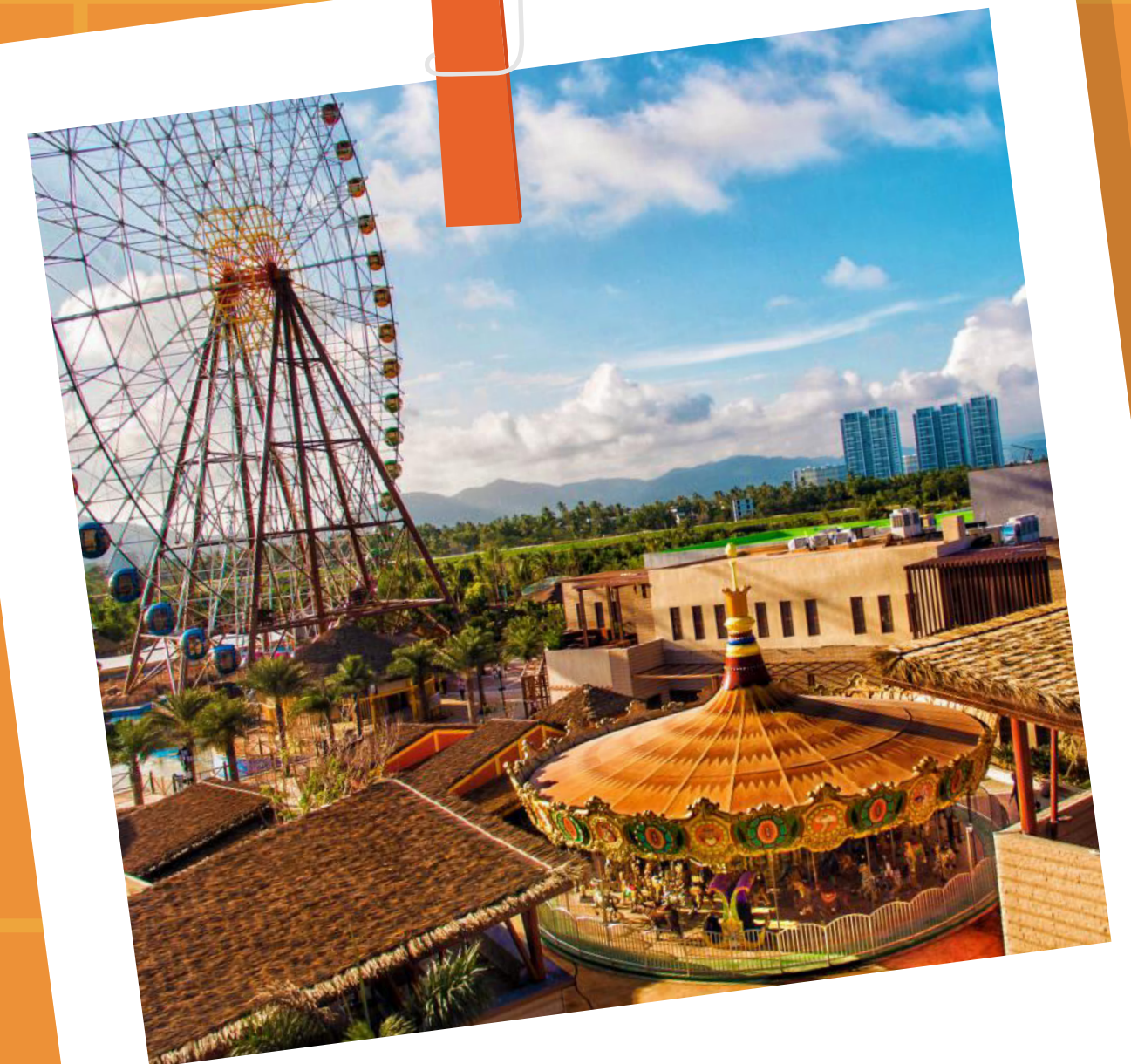
Sanya Haichang Fantasy Town