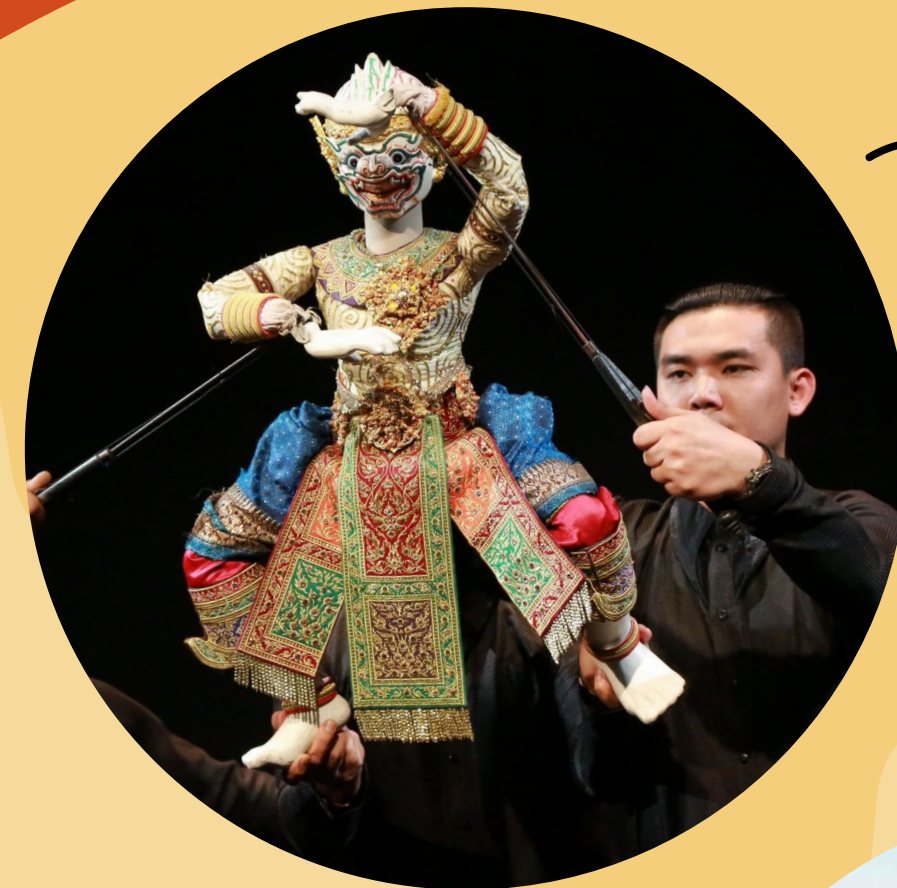
Watch a folkloric puppet show