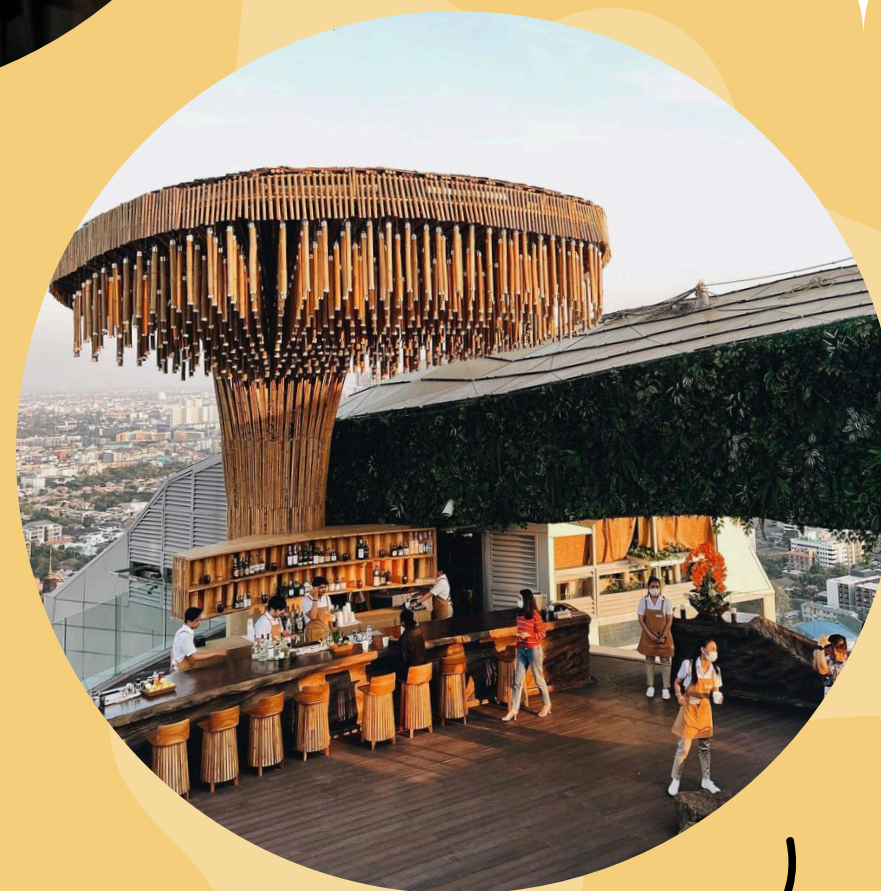
Sip on tipples at the Tichuca Rooftop Bar