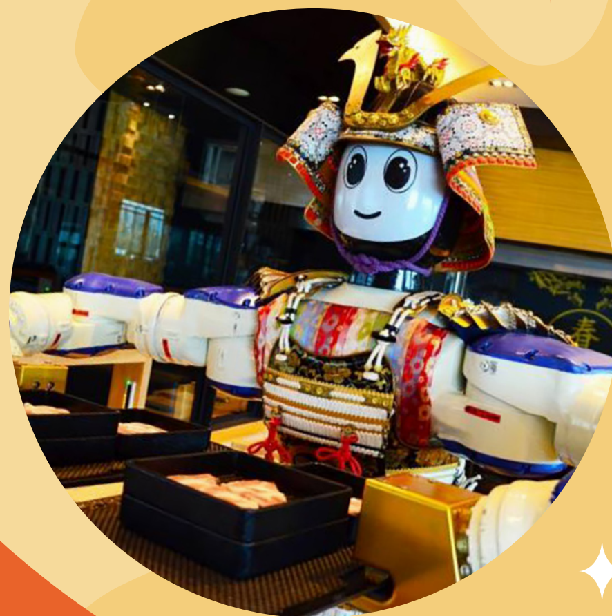
Visit the Hajime Robot Restaurant