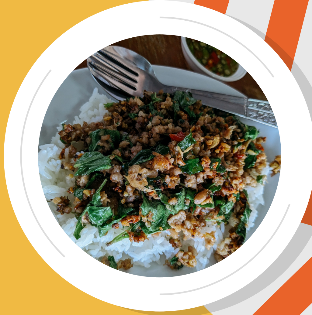
Pad Kra Pao