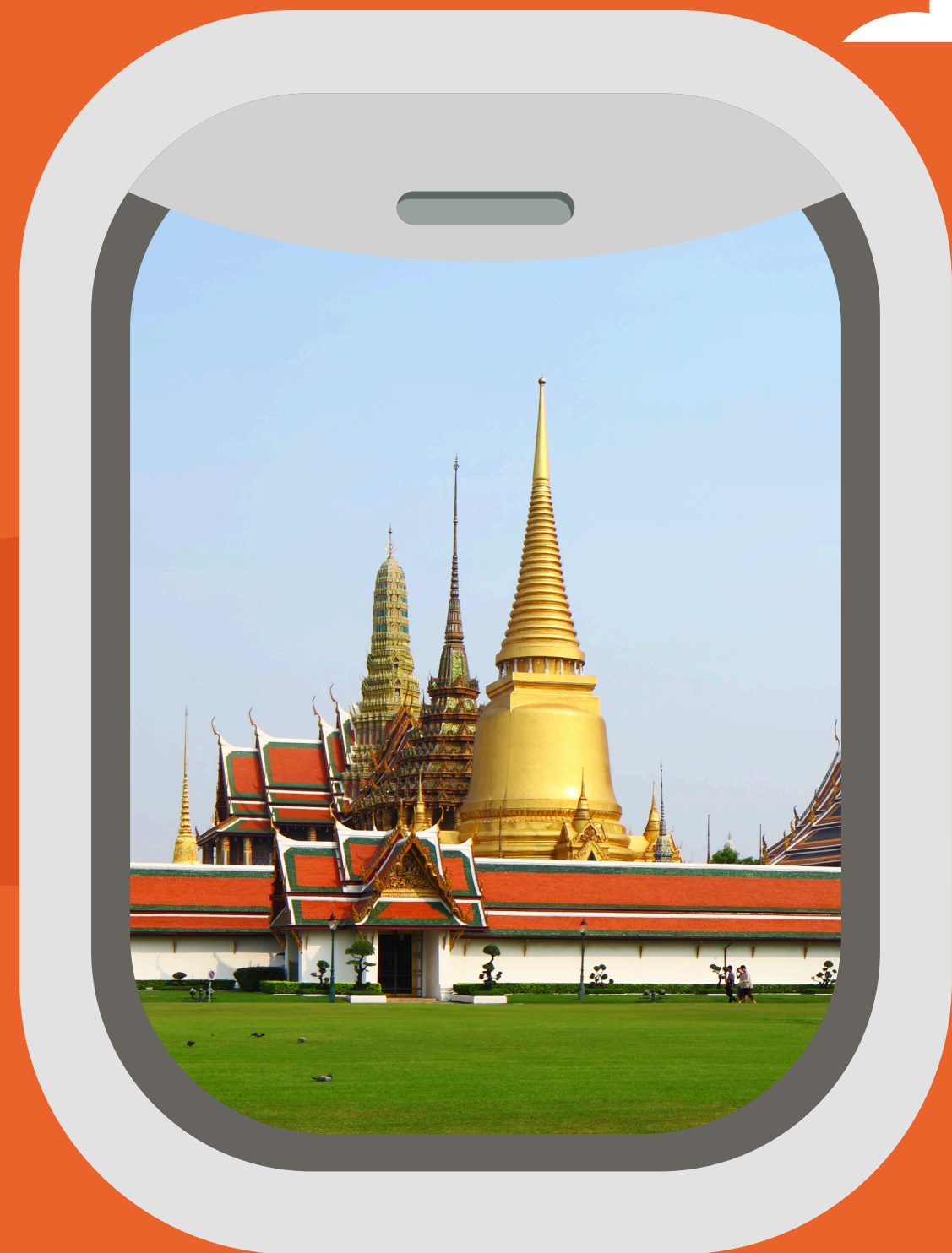
The Grand Palace and Wat Phra Kaew