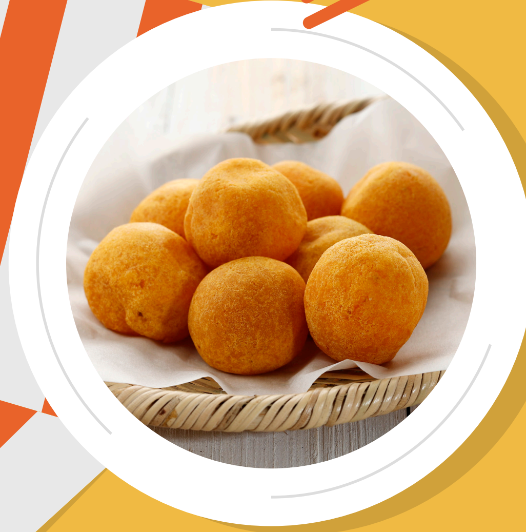
Kanom Kai Nok Krata